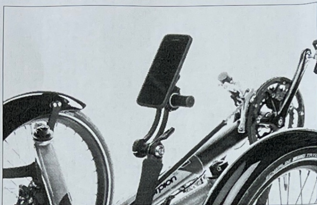
Fig 1 Mounted TopView holder with additional mobile phone holder and mobile phone